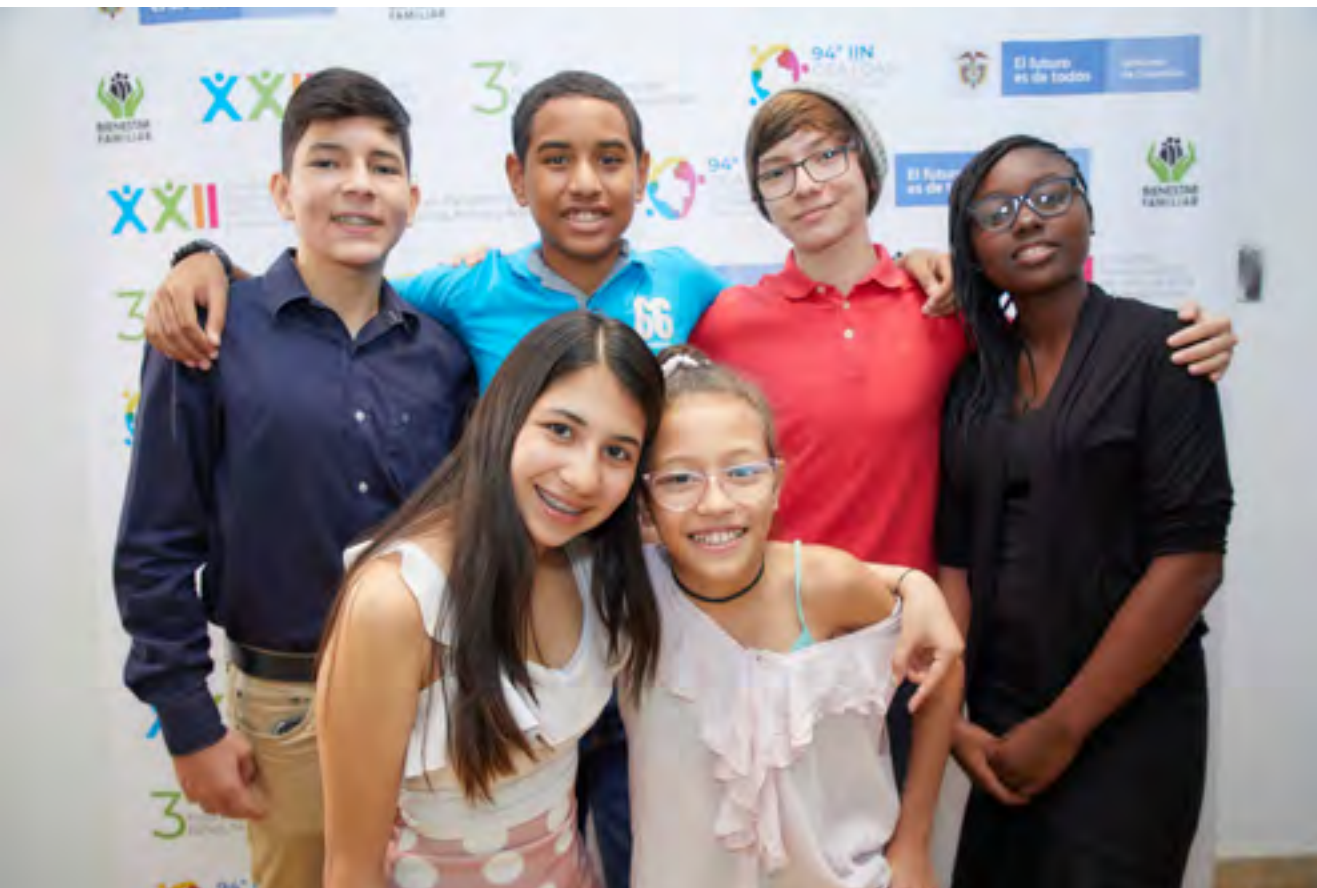
Participants of the III Pan-American Forum of Children and Teenagers, in Cartagena, Colombia.