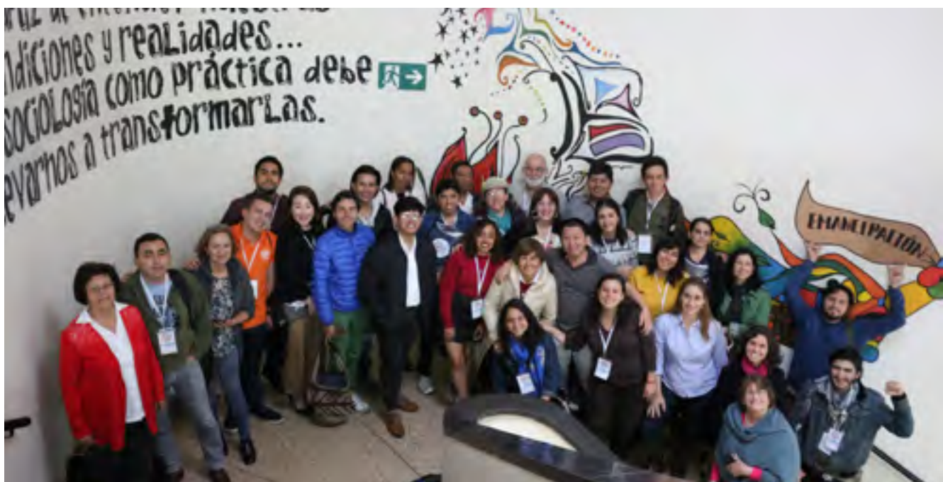
Participants of the conversation with students held within the framework of CLADE's 10th Regional Assembly in Bogotá, Colombia (October 2018).