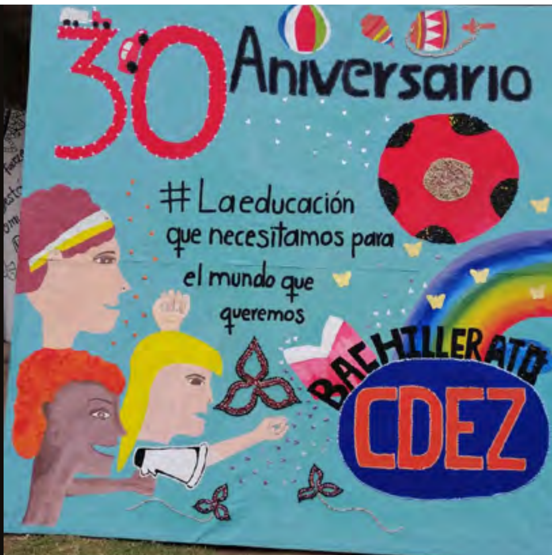
Photograph of a poster made for a rally organized by young people in Mexico to demand the realization of the right to education, on November 20, 2019.

“I believe education should be initially public, free, secular, that it should have quality. [I believe] that students can have an active participation in the decisions on how they expect the education they believe to deserve should be.”