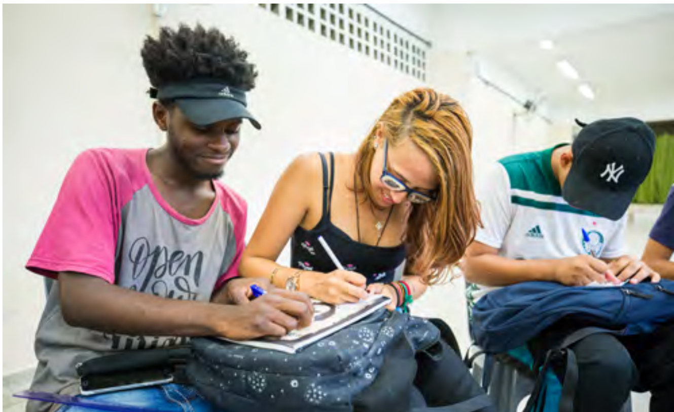
Activity to dialogue with young people from state school Maria Augusta Correa, in Sao Paulo, Brazil.