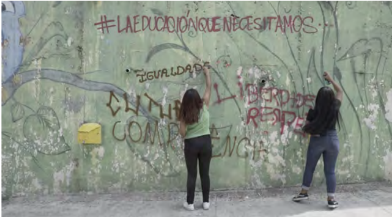
Graffiti activity carried out with young people from the state school Maria Augusta Correa in Sao Paulo, Brazil.

Although progress was achieved in terms of a perspective of equality and human rights and thanks to the efforts of the international community and the organized civil society, in practice, over the last years, in different countries in Latin America and the Caribbean, what has been unfortunately observed are tendencies towards the implementation of policies that prioritize the technocratization and homogenization of education systems and persons, seeing them as simple tools that have a power of consumption and are good to be incorporated to the labor market, from a purely instrumental and commodifying view.