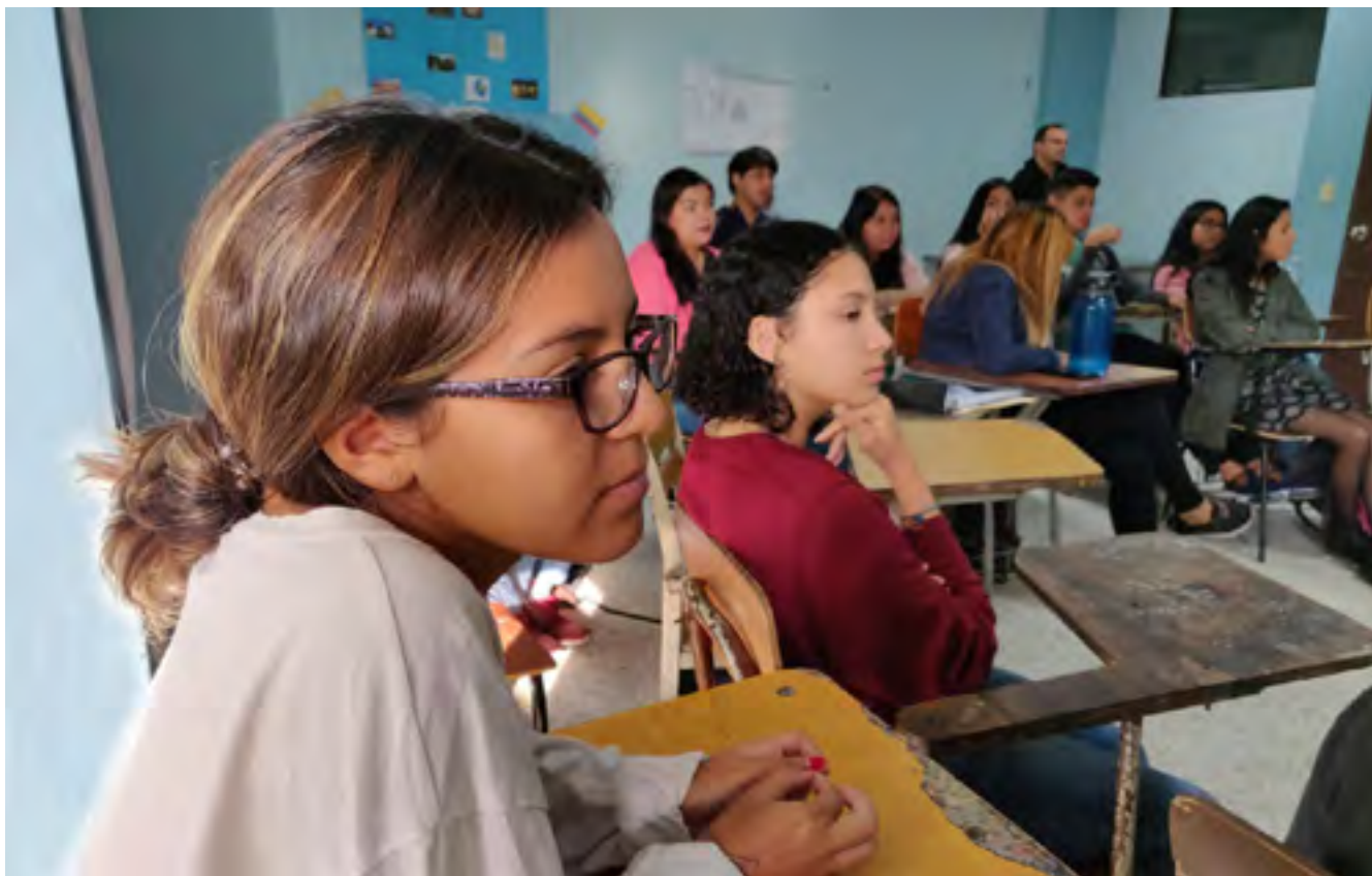
Dialogue at the University of El Salvador (UES, by its Spanish acronym).

In their testimonies, adolescents and young people reinforce that quality and equality in education depend on education gratuity for all and on sufficient public funding to ensure that education centers have the adequate infrastructure, as well as teachers with good training and dignifying work conditions.