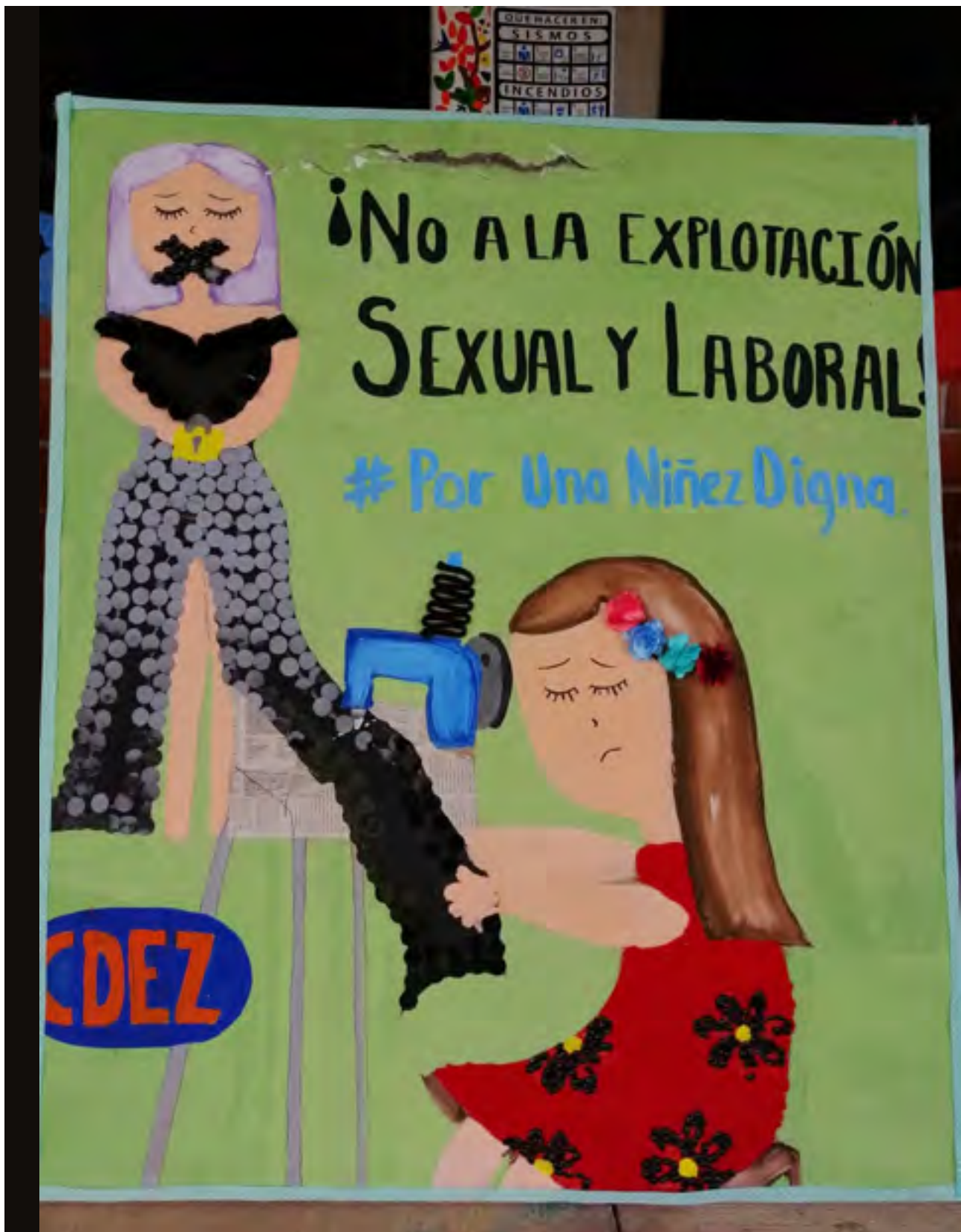
Rally organized by young people from Mexico to demand the realization of their right to education on occasion of the anniversary of the Mexican revolution, on November 20, 2019.