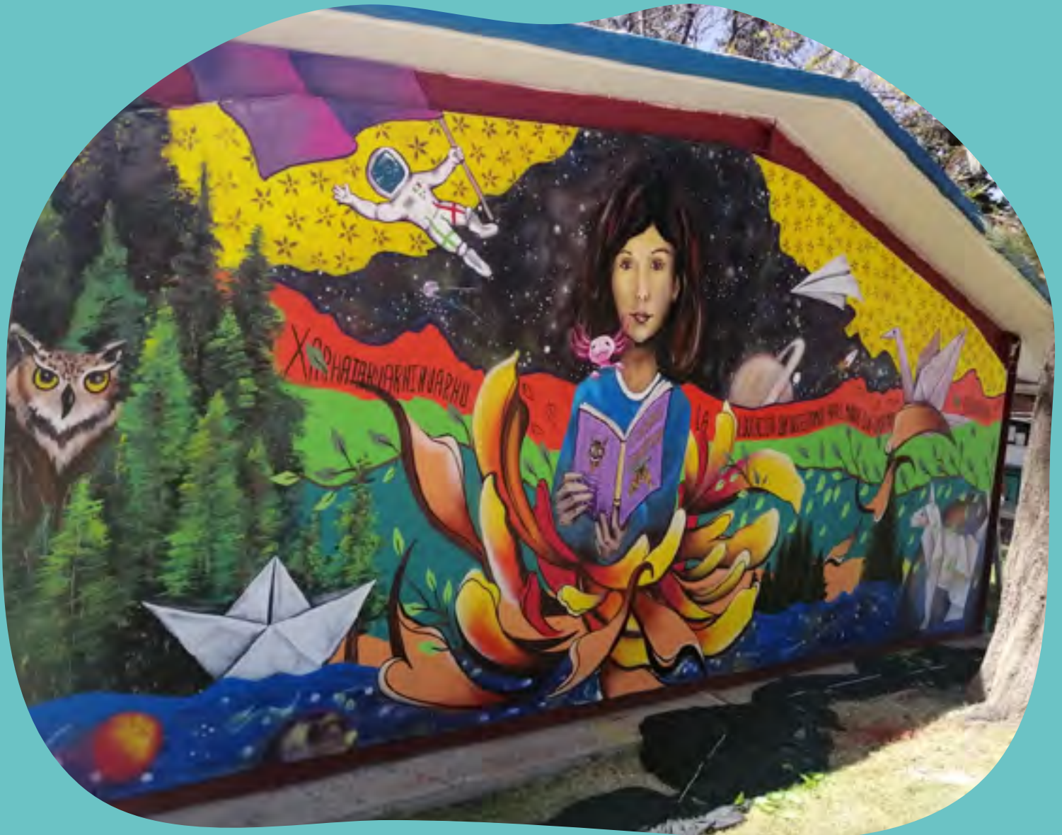
Wall painting made by students, artists and teachers of Prefeco Melchor Ocampo middle school, in the city of Morelia, México, presenting the perspectives of adolescents and young people about their right to education