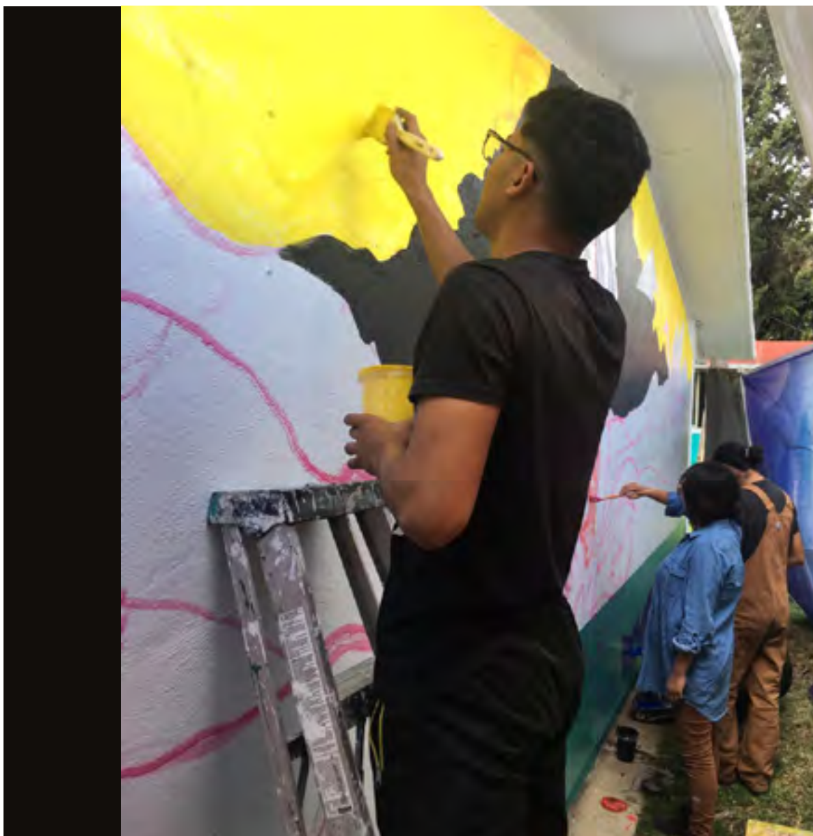
Students and artists paint a mural at the Prefeco Melchor Ocampo High School in Michoacán, Mexico, within the framework of the “The Education We Need for The World We Want” initiative.