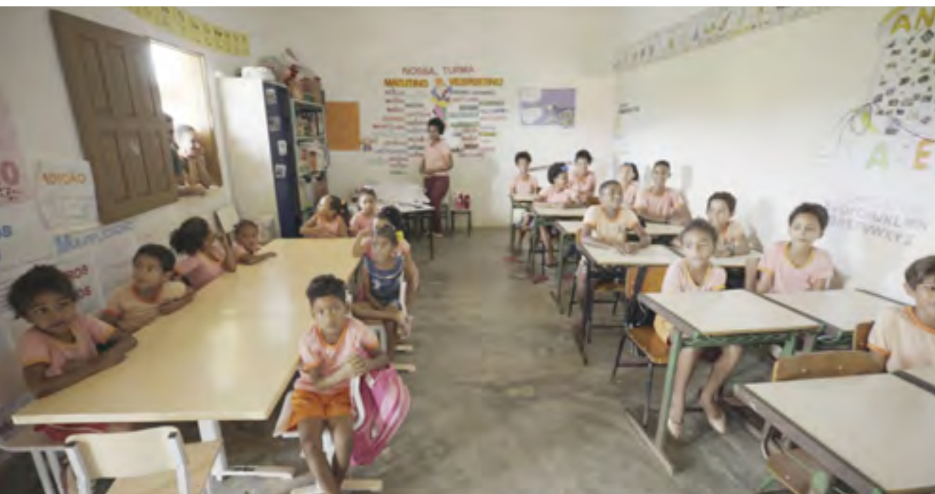
Students from the school of "Dois Riachões" slum, of the Landless Movement (MST, by its Spanish acronym), Bahia, Brazil.

In such a context, it is urgent and necessary to rethink our education, our society and economy models, as well as the exercise of citizenship and also the world and the future we want. In order to protect, respect and fulfill the right to education in the present situation, it is crucial that the education community dialogues and considers everything that is implicated in the current pandemic, in social as well as environmental terms, what includes acknowledging the centrality of looking after other people's lives, practicing solidarity and collective responsibility. After all, practicing the sense of community is also an integral part of the human right to education and this collective thinking of considerations, ways and proposals must be based on the respect of the right of participation of members of education communities, among which are students, adolescents and young people.