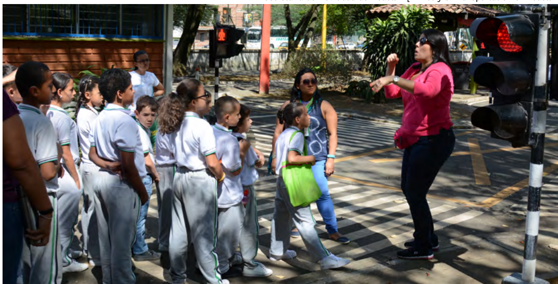
Secretaría de Movilidad de Medellín [Ministry of Transportation of Medellín]

A total of 216 people participated in the consultation, both, from the education community (148 responses) and from civil society organizations and academia (68 responses). Mostly teachers and relatives of persons with disabilities from the education community answered the consultation while, from the second group, mainly civil society organizations replied to the consultation. People from a total of 19 countries participated in the consultation: Argentina, Bolivia Brazil, Chile, Colombia, Costa Rica, Ecuador, El Salvador, Spain, Guatemala, Haiti, Honduras, Mexico, Nicaragua, Paraguay, Peru, Dominican Republic, Uruguay and Venezuela.